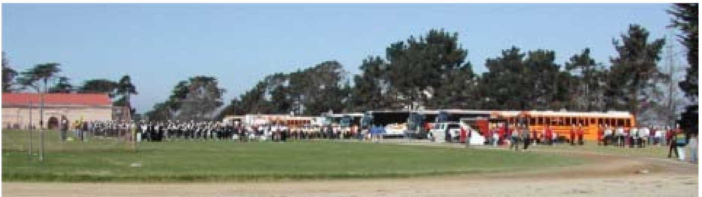
The 2003 PG Marching Band Festival featured dozens of bands, hundreds of busses, thousands of participants, thousands of spectators, and ham radio. The PGMBF provides us with an outstanding training opportunity as we serve our local community.