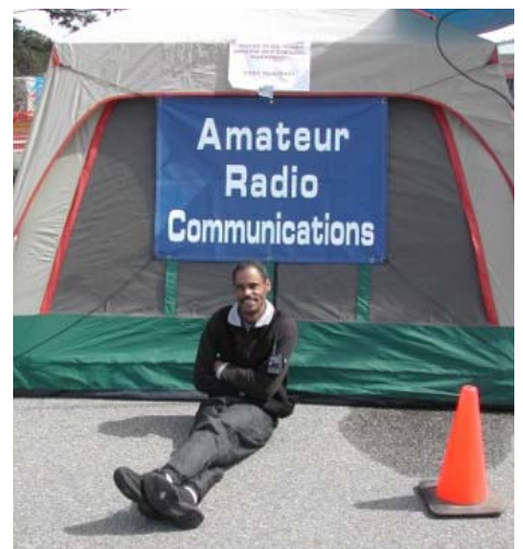
KE6NLP on a break from BSIM action at Staging—our alternate CP, alternate NCS, Intel Center, and logistics base.